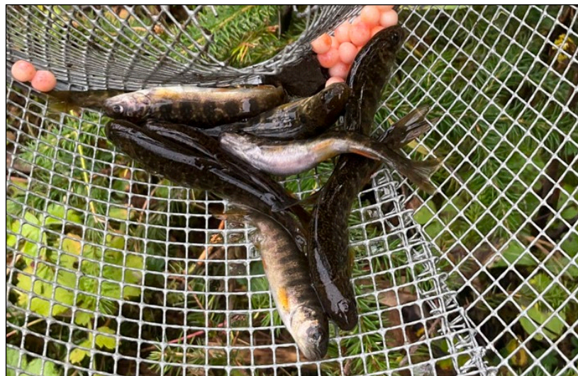
Figure 1.–Juvenile coho salmon and Dolly Varden captured at waypoint 1230.