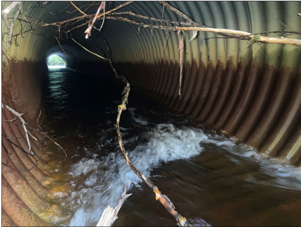
Figure 3.–Inside of culvert looking downstream.