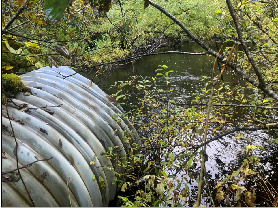
Figure 2.–Channel downstream of the culvert.